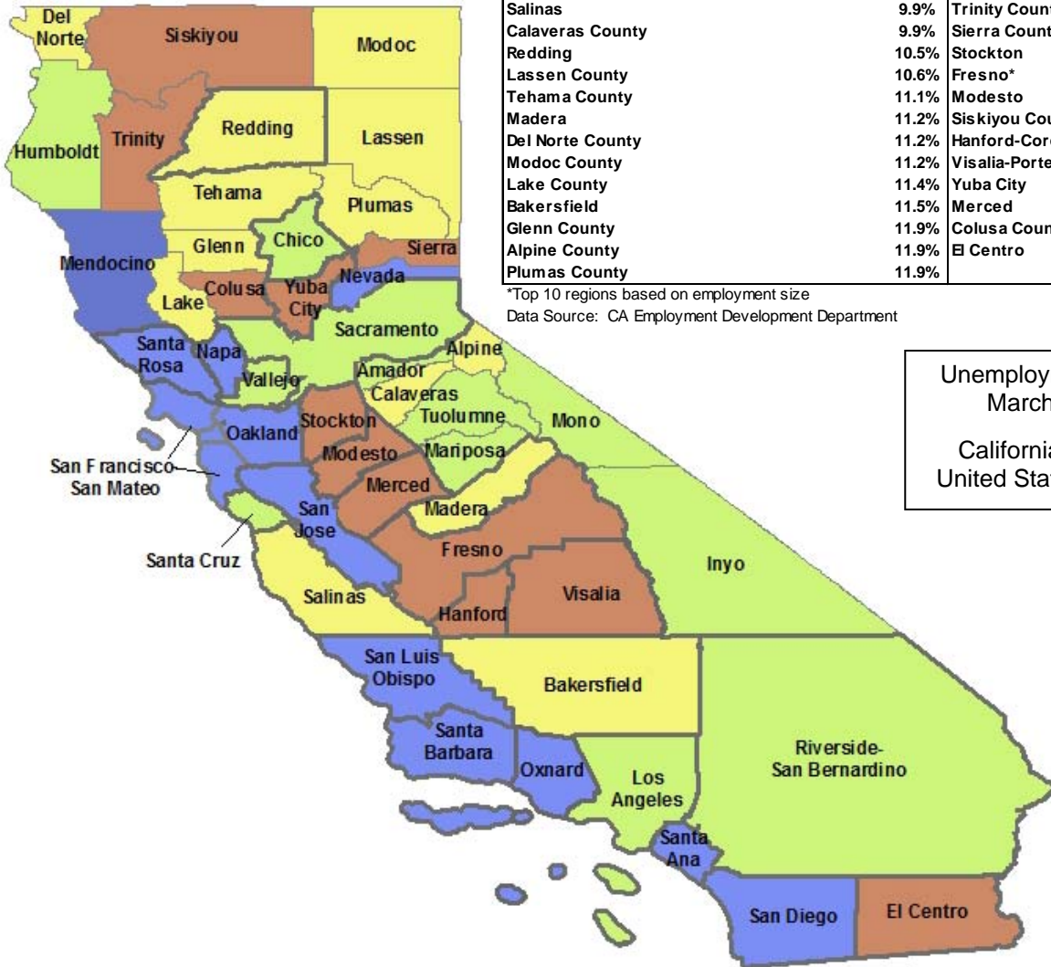
Unemployment Rate Metropolitan Areas and Non-Metropolitan Area Counties March 2014 (Seasonally Adjusted Annual Average)