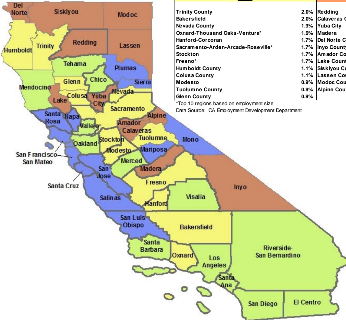
Annual Job Growth March 2013