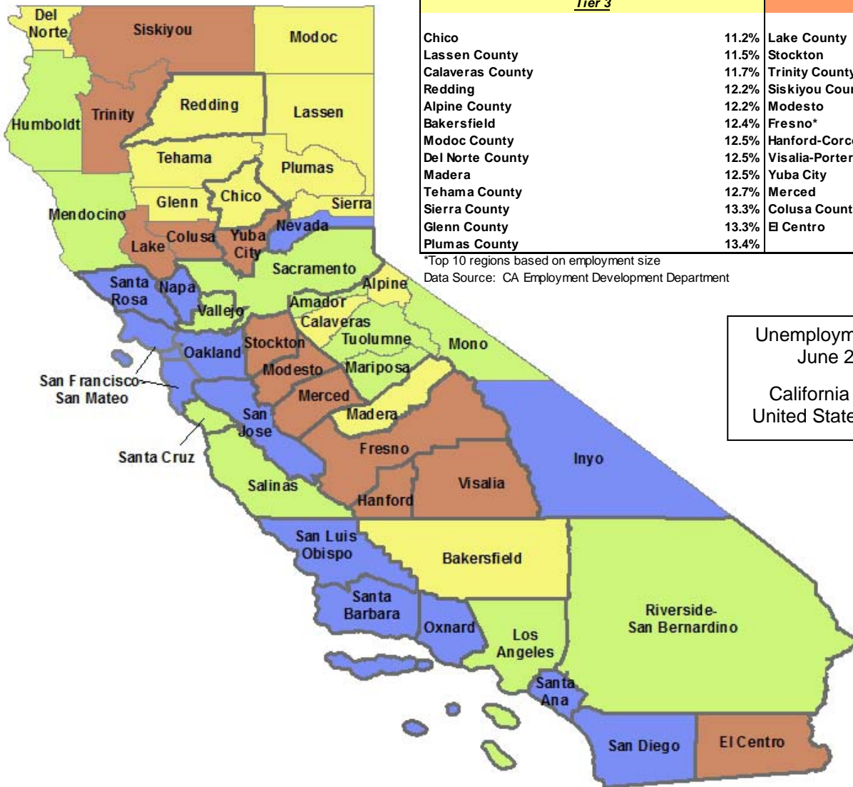
Unemployment Rate June 2013 (Seasonally Adjusted Annual Average)