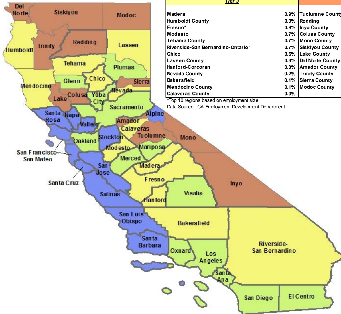
Annual Job Growth June 2013