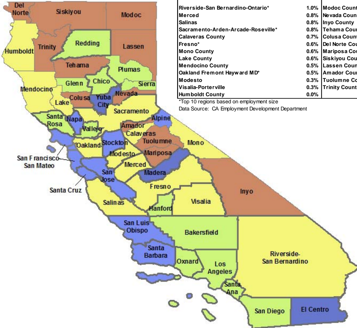
Annual Job Growth Metropolitan Areas and Non-Metropolitan Area Counties September 2013