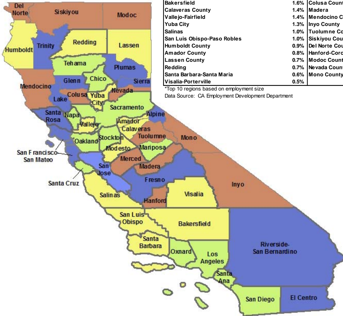
Annual Job Growth Metropolitan Areas and Non-Metropolitan Area Counties June 2014