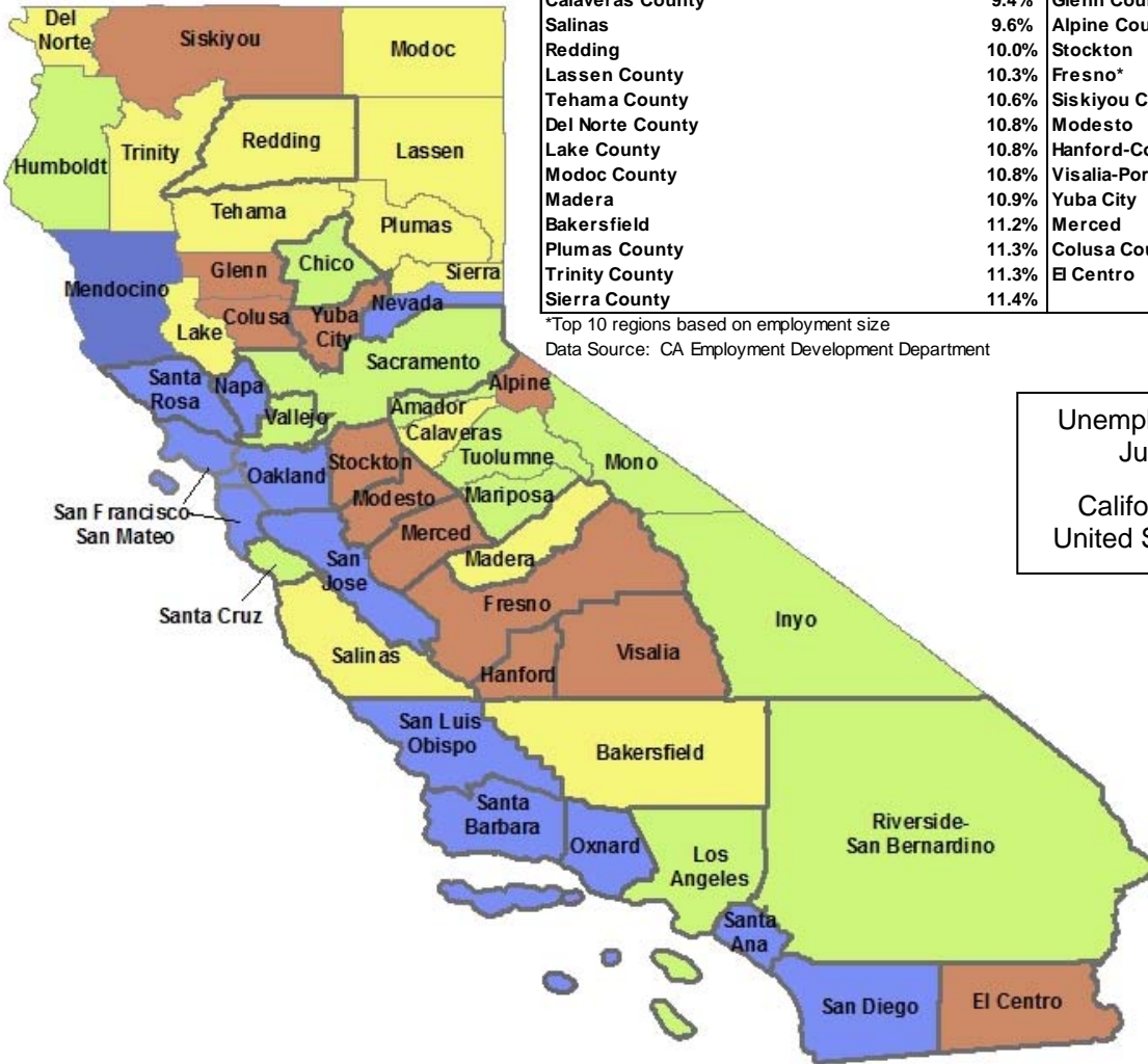
Unemployment Rate Metropolitan Areas and Non-Metropolitan Area Counties June 2014 (Seasonally Adjusted Annual Average)